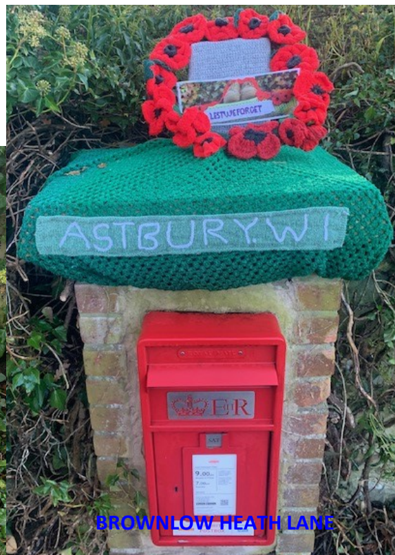
BROWNLOW HEATH LANE