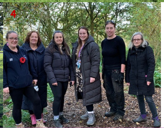
1, 2,3 Parishioners and councillors on the green. 4. Astbury School team and chair of the Parish Council at Brownlow Heath.