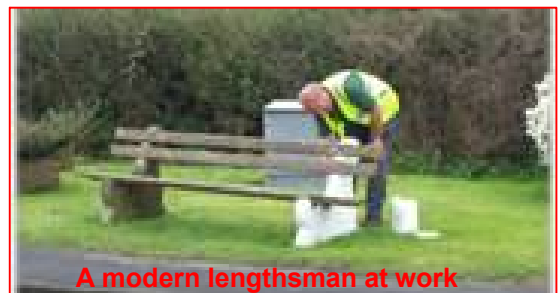
A modern lengthsman at work